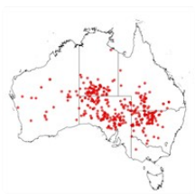
Acacia brachystachya occurrence map. Occurrence map generated via Atlas of Living Australia ( https://www.ala.org.au ).