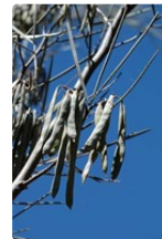
Source: Australian Plant Image Index (dig.18624). ANBG © M. Fagg, 2010