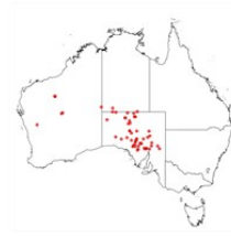
Acacia clelandii occurrence map. Occurrence map generated via Atlas of Living Australia ( https://www.ala.org.au ).