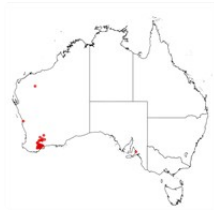
Acacia consobrina occurrence map. Occurrence map generated via Atlas of Living Australia ( https://www.ala.org.au ).