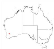
Acacia cowaniana occurrence map. Occurrence map generated via Atlas of Living Australia ( https://www.ala.org.au ).