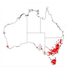
Acacia dealbata subsp. dealbata occurrence map. Occurrence map generated via Atlas of Living Australia ( https://www.ala.org.au ).