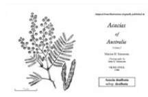
See illustration.