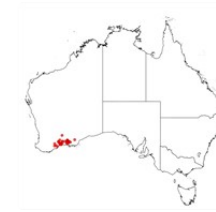
Acacia dermatophylla occurrence map. Occurrence map generated via Atlas of Living Australia ( https://www.ala.org.au ).