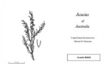
See illustration.