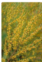
Source: WorldWideWattle ver. 2. Published at: www.worldwidewattle.com B.R. Maslin