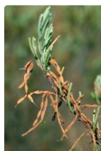
Source: WorldWideWattle ver. 2. Published at: www.worldwidewattle.com B.R. Maslin