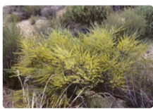
Source: WorldWideWattle ver. 2. Published at: www.worldwidewattle.com B.R. Maslin