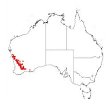
Acacia dielsii occurrence map. Occurrence map generated via Atlas of Living Australia ( https://www.ala.org.au ).