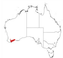
Acacia ferocior occurrence map. Occurrence map generated via Atlas of Living Australia ( https://www.ala.org.au ).