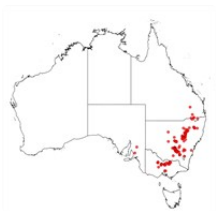
Acacia flexifolia occurrence map. Occurrence map generated via Atlas of Living Australia ( https://www.ala.org.au ).