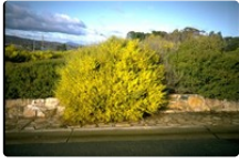
Source: Australian Plant Image Index (a.19324). ANBG © M. Fagg, 1992