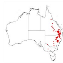
Acacia ixiophylla occurrence map. Occurrence map generated via Atlas of Living Australia ( https://www.ala.org.au ).