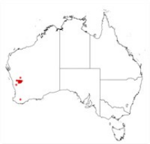
Acacia kochii occurrence map. Occurrence map generated via Atlas of Living Australia ( https://www.ala.org.au ).