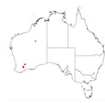
Acacia lanuginophylla occurrence map. Occurrence map generated via Atlas of Living Australia ( https://www.ala.org.au ).