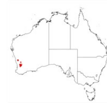
Acacia lirellata subsp. lirellata occurrence map. Occurrence map generated via Atlas of Living Australia ( https://www.ala.org.au ).