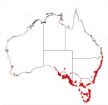
Acacia longifolia subsp. sophorae occurrence map. Occurrence map generated via Atlas of Living Australia ( https://www.ala.org.au ).