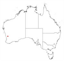
Acacia pharangites occurrence map. Occurrence map generated via Atlas of Living Australia ( https://www.ala.org.au ).