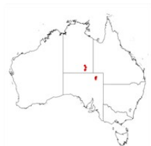
Acacia pickardii occurrence map. Occurrence map generated via Atlas of Living Australia ( https://www.ala.org.au ).