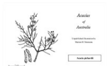
See illustration.