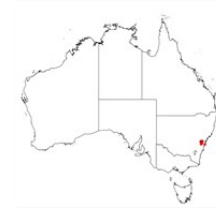
Acacia ptychoclada occurrence map. Occurrence map generated via Atlas of Living Australia ( https://www.ala.org.au ).