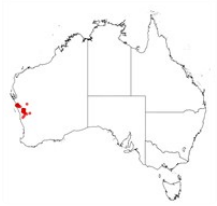
Acacia puncticulata occurrence map. Occurrence map generated via Atlas of Living Australia ( https://www.ala.org.au ).