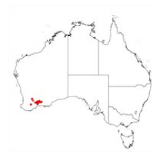
Acacia quinquenervia occurrence map. Occurrence map generated via Atlas of Living Australia ( https://www.ala.org.au ).