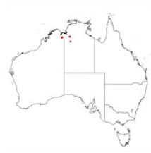
Acacia repens occurrence map. Occurrence map generated via Atlas of Living Australia ( https://www.ala.org.au ).