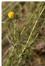
Source: WorldWideWattle ver. 2. Published at: www.worldwidewattle.com B.R. Maslin