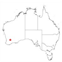
Acacia sedifolia subsp. sedifolia occurrence map. Occurrence map generated via Atlas of Living Australia ( https://www.ala.org.au ).