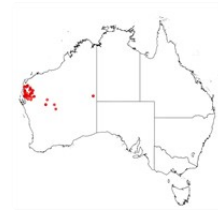
Acacia subtessarogona occurrence map. Occurrence map generated via Atlas of Living Australia ( https://www.ala.org.au ).