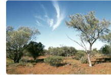
Source: WorldWideWattle ver. 2. Published at: www.worldwidewattle.com B.R. Maslin