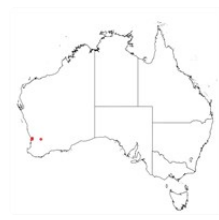
Vachellia karroo occurrence map. Occurrence map generated via Atlas of Living Australia ( https://www.ala.org.au ).